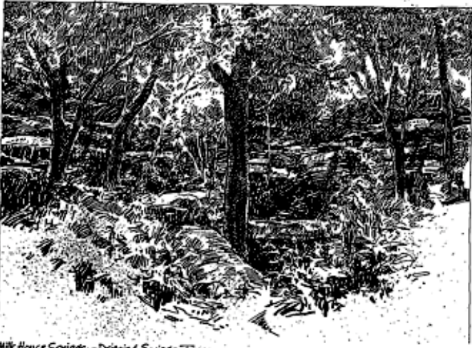
Milk House Springs—Dripping Springs, Texas